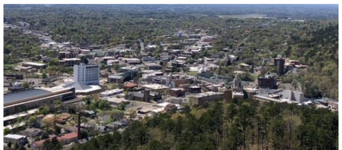
Downtown Hot Springs