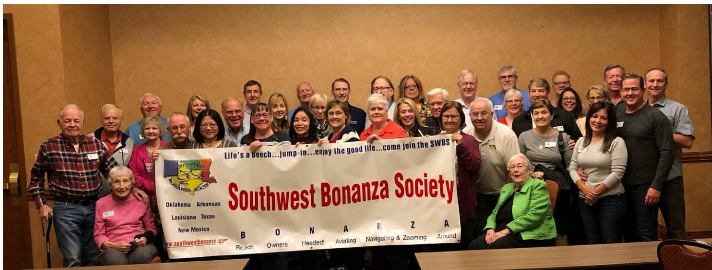
SWBS Hot Springs Fly In April 8-10 2022