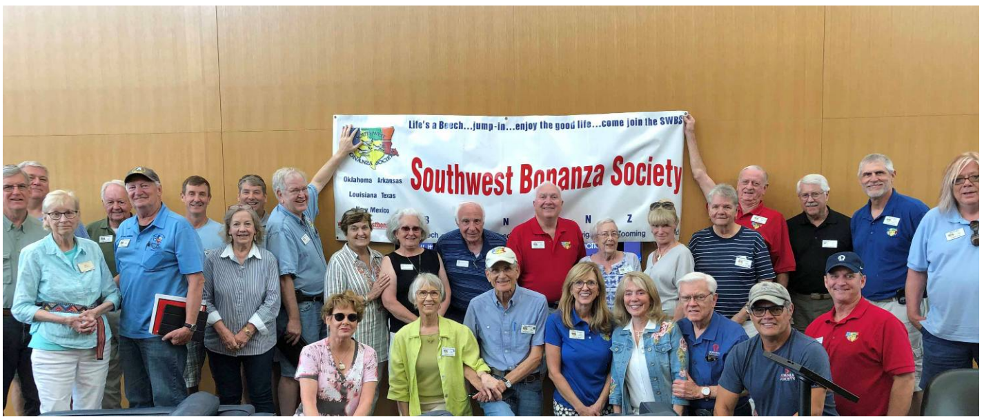
SWBS Gate12 Fly In, June 12, 2021