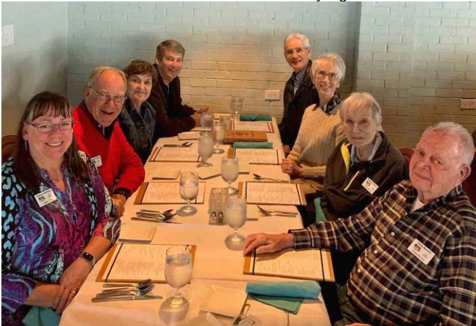
Dinner at the Mariner Saturday night