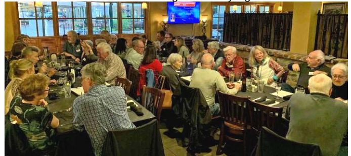
Dinner at the Maglieux Friday night