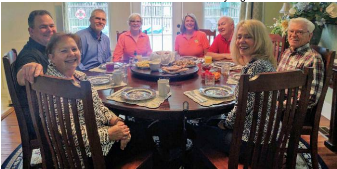
Breakfast at the Good House