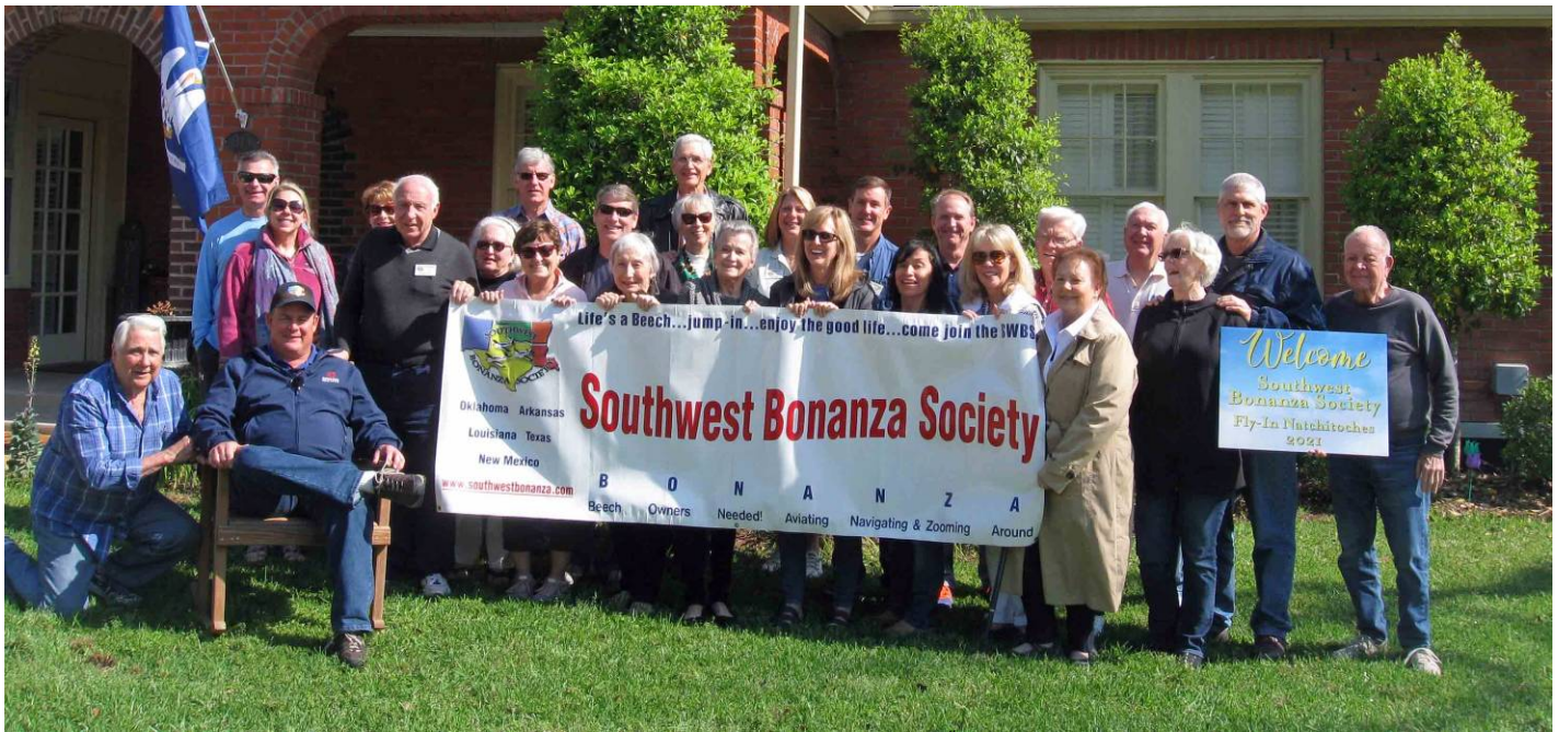
SWBS Natchitoches Fly In April 15—18 th 2021