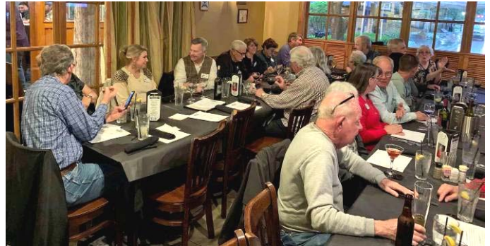
Dinner at the Maglieux Friday night

Sunday Morning as always was bittersweet as we gathered for our traditional group picture before heading back to Natchitoches regional Airport. Time to say good-bye to friends and start our trips home until out next SWBS adventure.