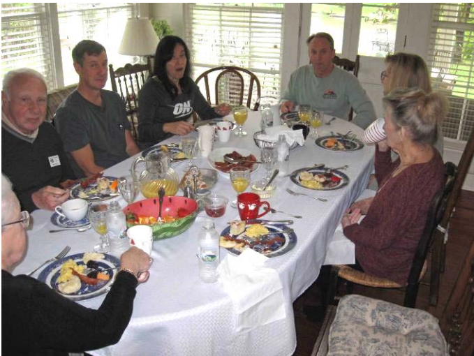
Breakfast at the Creole Cottage