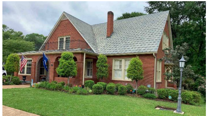
The Good House B&B

Everyone settled in to one of their Bed & Breakfasts we were staying at in Natchitoches. The Good House, Judge Porter House, Creole Cottage, Jefferson House and Rusca House were all a new experience for our fly ins. Each one was within walking distance of each other and beautifully appointed & welcoming.