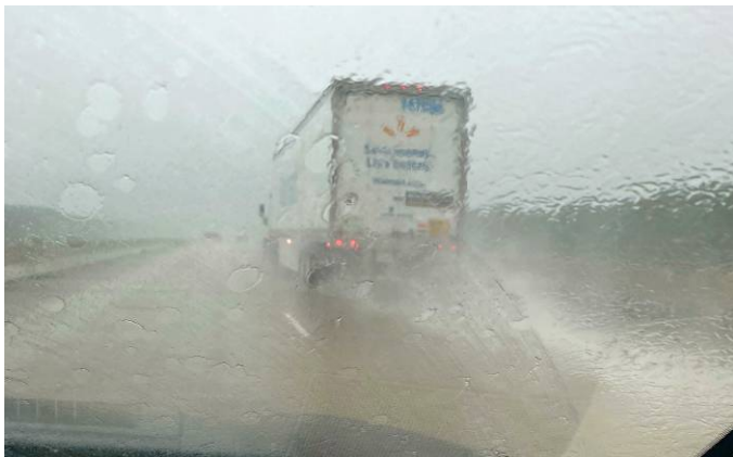
Driving in on Friday