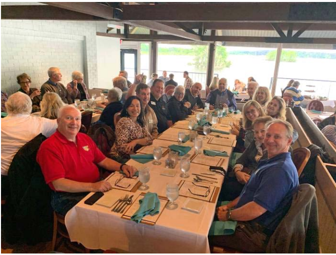
Dinner at the Mariner Saturday night