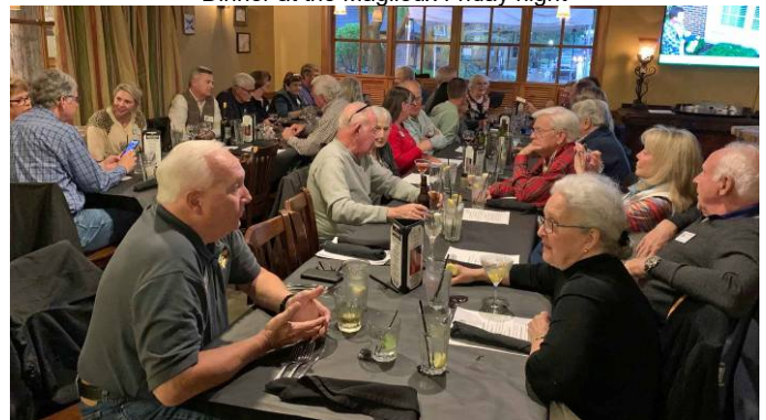
Dinner at the Maglieux Friday night