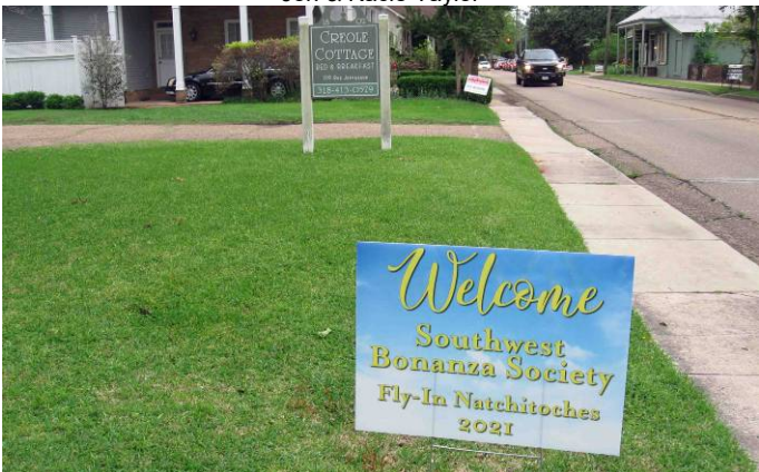
These signs were displayed in front of each SWBS B&B