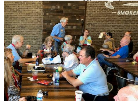
Dinner at the Rendezvous