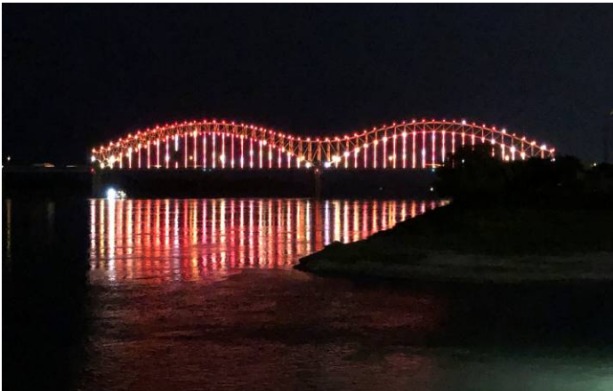
Bridge across the Mississippi

Everyone had the rest of the afternoon off before it was time to put on the fancy duds and dancing shoes to head to the Memphis Queen for a dinner and dancing cruise down the mighty Mississippi.