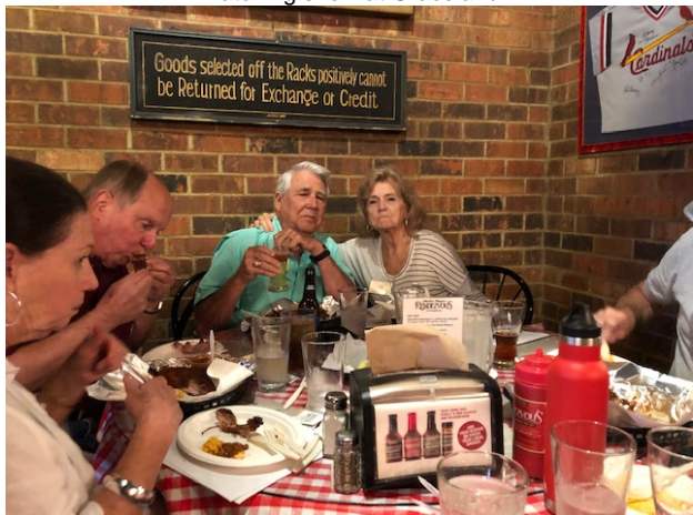
Chowing down at the Rendezvous Restaurant