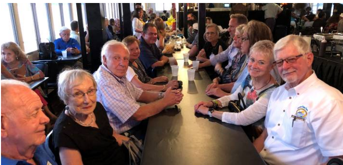
On the Memphis Queen

The Southwest group was the hit of the boat and tearing up the dance floor to some good ole Memphis Blues and Jazz music.