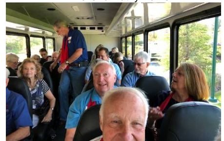
On the bus to Graceland