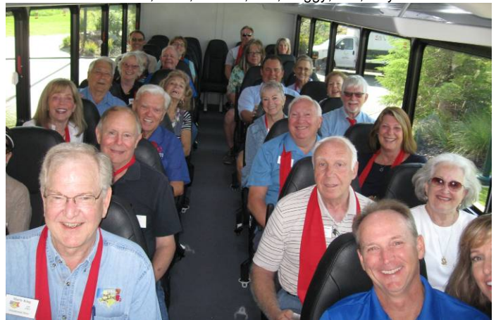
On the bus to Graceland