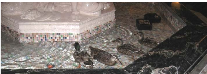
The Peabody ducks

After everyone arrived and got settled, we were off to the Peabody Hotel to watch the famous ducks make their red-carpet waddle from the lobby fountain into the elevators headed for their rooftop home. The ducks have been doing this since the 1930's when this tradition began – albeit – not the same ducks.