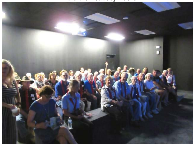
Watching show at Graceland