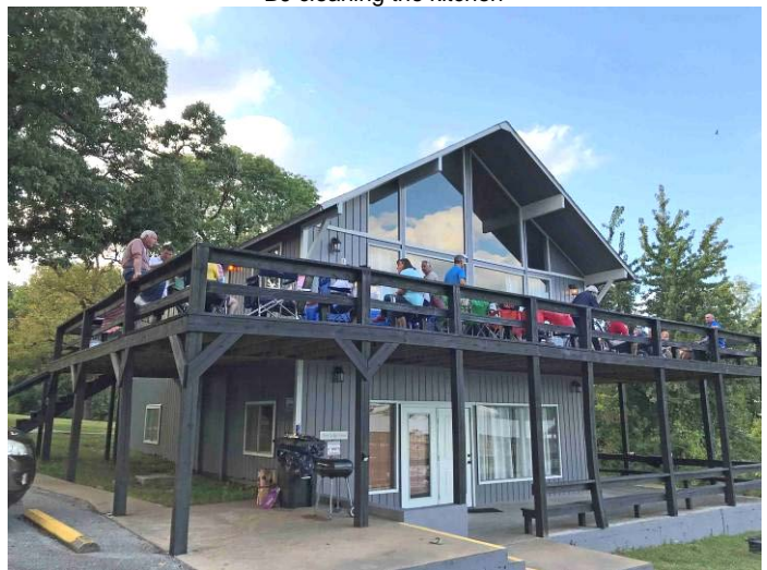
The main cabin