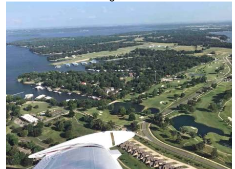
Aerial view of the airport—top center