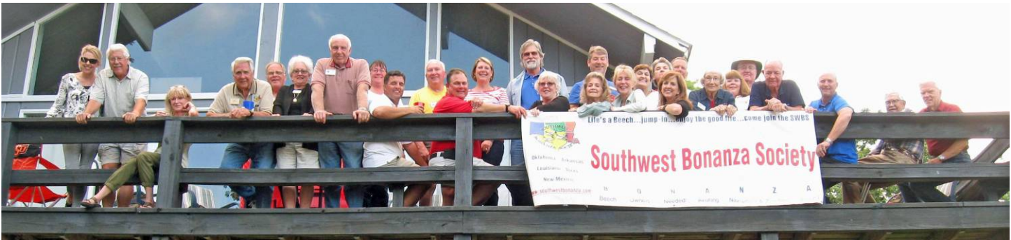
SWBS Grand Lake Fly In September 29, 2018