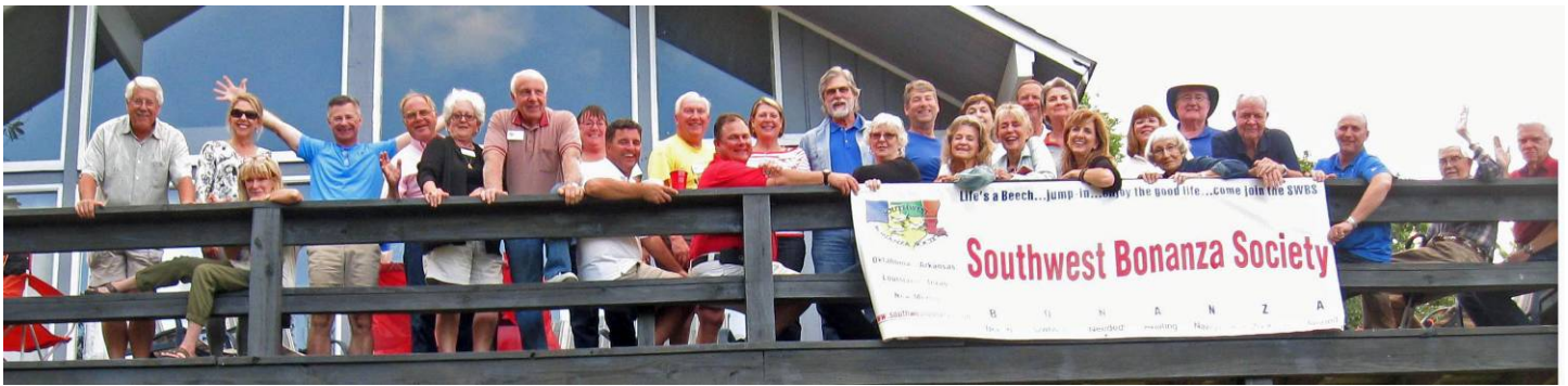
SWBS Grand Lake Fly In September 29, 2018