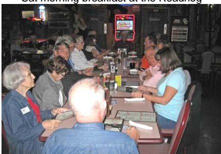
Sat morning breakfast at the Roadhog