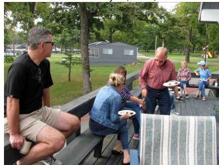
Sunday morning breakfast