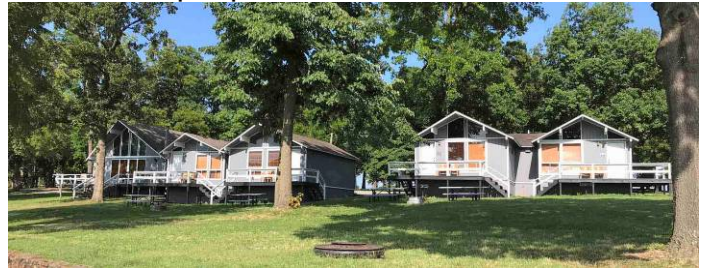
Some of the cabins

Lots more to tell but, in the end, it all started to come together . The lingering questions for me were whether the lodging was musty and falling apart and whether SWBS members would accept the plan. An end-of-season negotiation allowed for a fixed rate per couple for a bedroom. I decided to fly up to Grand Lake for a first hand look at the cabins. They had been recently remodeled so they were fine. A polling of the members seemed encouraging. As I arranged a boat tour of the lake I learned that they needed to limit capacity to about 30 people. If I was able to fill all cabins, that would equate to about 30 people. Hmmm. I see a trend here.