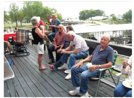
Sunday morning breakfast