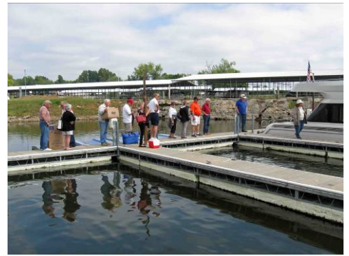
Boarding the yacht