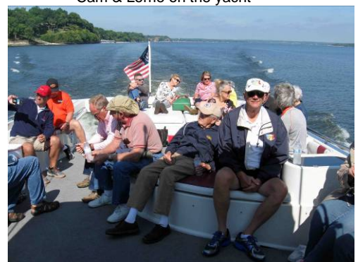
Cruising aboard the yacht