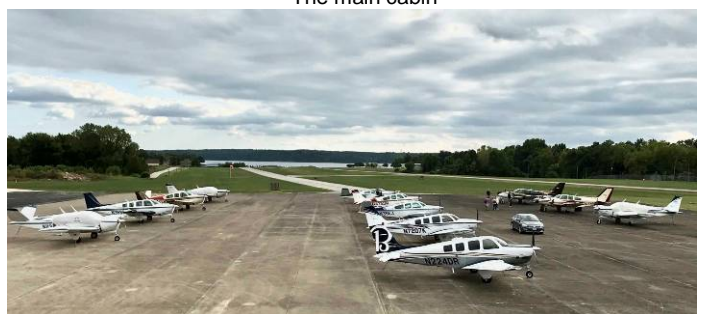
SWBS Aircraft on the ramp